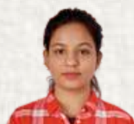
Chaina Mali JMC